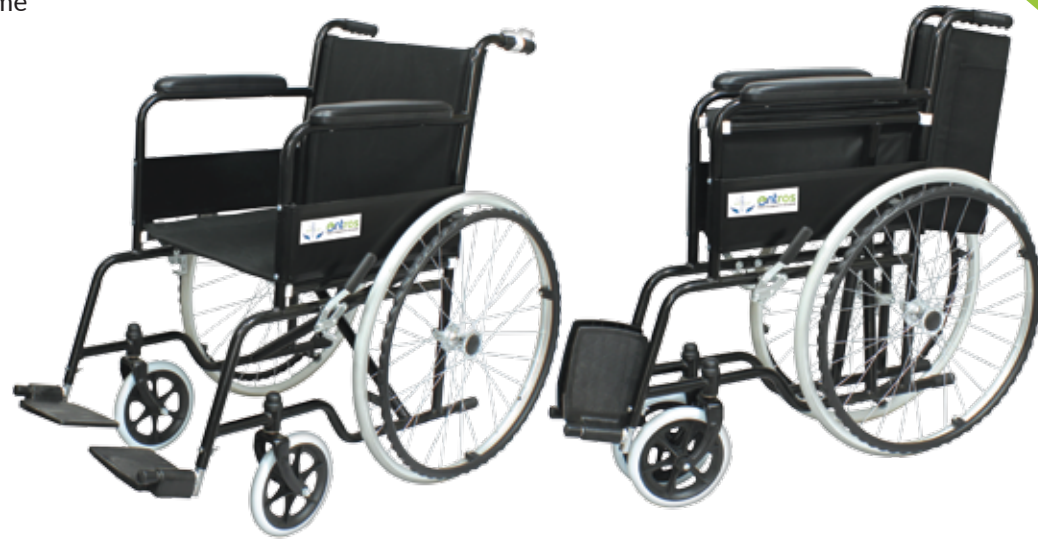
MAIN PARAMETERS (CM)