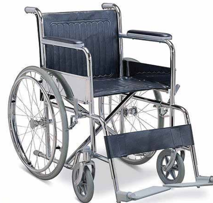
MAIN PARAMETERS (CM)