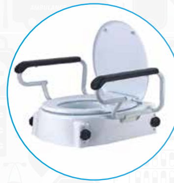
RAISED TOILET SEATS WITH ARMREST