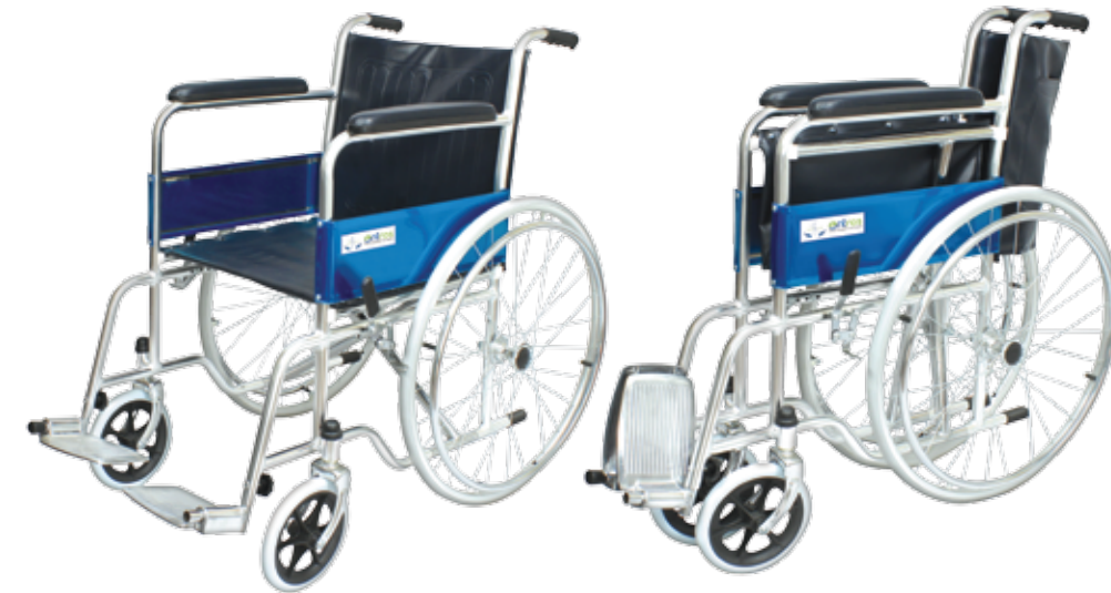
MAIN PARAMETERS (CM)