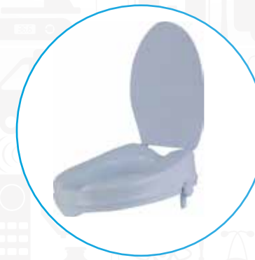
RAISED TOILET SEATS WITH LID